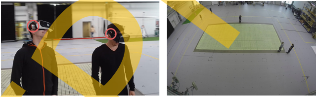
Figure 4: Left: Users immersed in the simulation. A RedFIR sensor tracker was attached to each user for position tracking. Right: Overview of the tracking space and physical scenario.