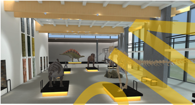
Figure 3: The virtual dinosaur museum. Six dinosaur exhibits included a short audio information displayed to users close ( <4\text{m} ) to the object. The physical and virtual spaces had identical dimensions.