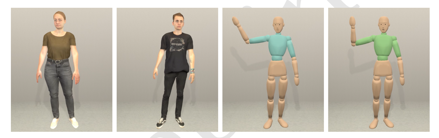
Figure 1: Participants observed realistic or abstract virtual humans, either with low (2D-screen) or high immersion (VR). Realistic virtual humans engaged in idle motion are shown on the left, and abstract virtual humans performing wave motion on the right.

HCI Group University of Würzburg Würzburg, Germany marc.latoschik@uni-wuerzburg.de