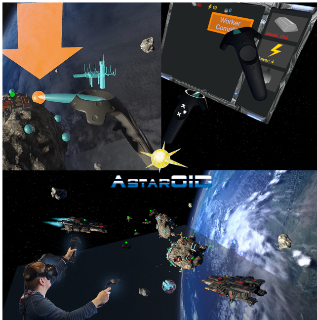
Figure 1: AStar0ID Gameplay Footage. Top Left: Selecting a construction site. Top Right: Choosing building types on a command panel. Bottom: A photomontage of the immersion as experienced by the player.

In AStar0ID, the player finds himself in a small asteroid belt, erecting buildings on the surfaces of the asteroids, harvesting energy and resources, and building a fleet of space ships to expand and defend the colony. The player is fully immersed into the scene. Scaled up by several dimensions, the player can directly interact with the game elements (Figure 1). The player interacts with the game using the 3D controllers of the HTC Vive hardware. The player can move units by selecting them and subsequently indicating any target position in space. The user interface (UI) is not implemented as a camera overlay, but is part of the game world. The player “holds” the UI in his left hand and can physically interact with it, just like an artist can interact with a palette. When a building menu is floating next to the player’s left hand, buildings can be setup by touch-selecting the desired type and pointing at a target location on an asteroid’s surface with the right hand. The player can move by walking in the real world. Winning the game requires fulfilling missions, defeating non-player character (NPC) enemies and expanding the colony. AStar0ID allowed us to systematically consider different options for transposing RTS dimensions to VR. In the following paragraphs, we present our findings.