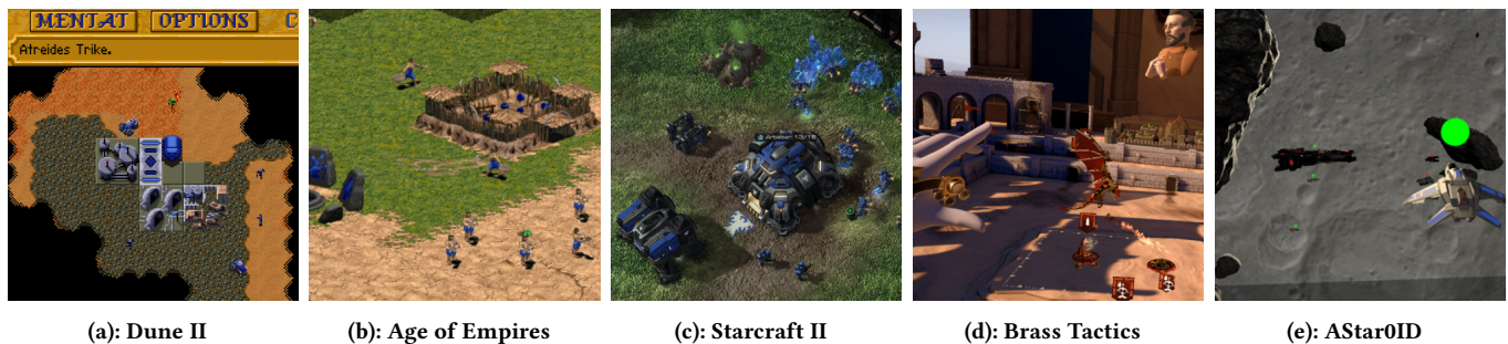
Figure 3: Comparison of perspectives in accordance with the continuum shown in Figure 2. It stretches from scenario S1 (2D visualization and 2D interaction) on the left to S7 (Full immersion in 3D) on the right.

As stated in the introduction, the RTS genre originated from the amalgamation of the action and strategy genres. Within the context of this scenario the player is engaged and surrounded by events (Figure 3(e)). Therefore, especially aspects of the action genre can be emphasized. Due to the the possibility to move in 3D, new strategies and combat styles can be used. Units can fire weapons that do not focus on a single target but deal areal damage. Opponents could try to dodge these attacks. Accordingly, the actual size of a unit has an impact on its performance in battle. The larger a spaceship, the easier it can be hit. Missiles can be intercepted by the surroundings or other units. Armies or colonies can hide behind